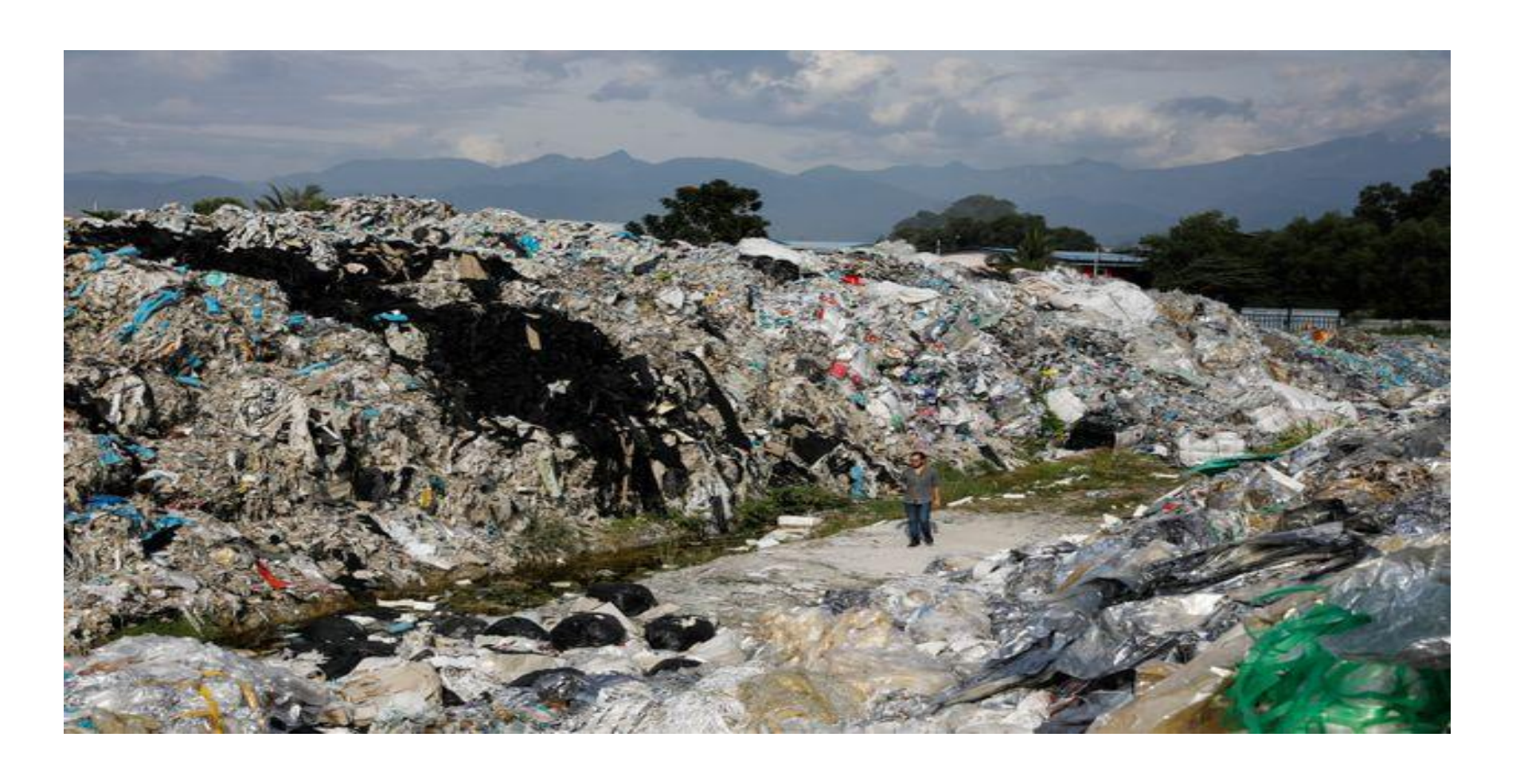
In 2018, Malaysia became the world's largest importer of plastic waste, after China banned imports of such waste.